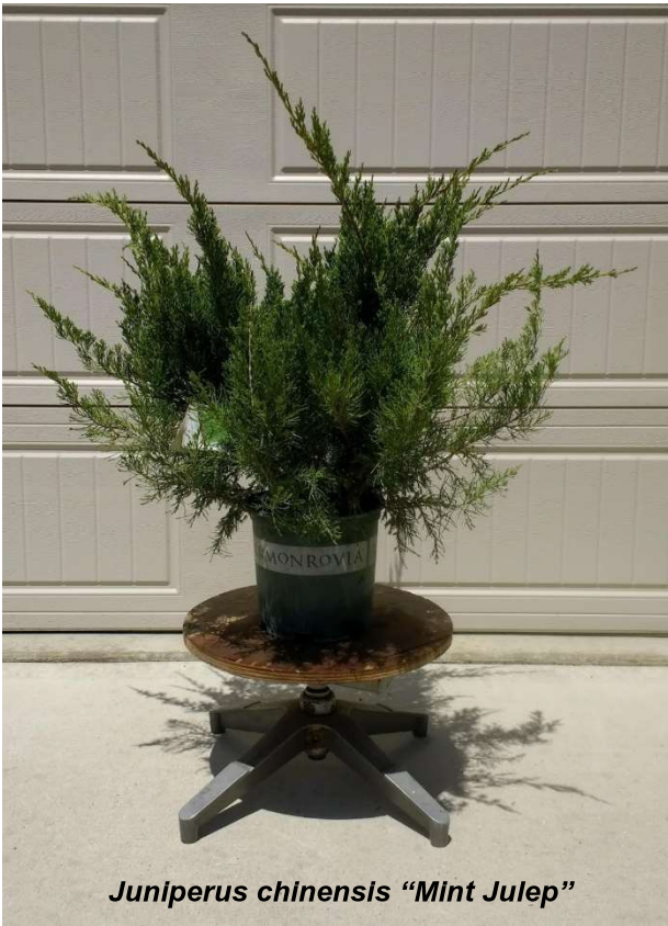
Juniperus chinensis "Mint Julep"

Note: Tip from Wayne re: Stoughton Nursery stock.